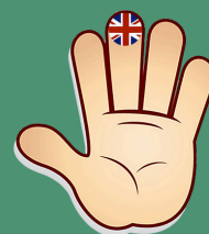
RESPECT OTHERS' BELIEFS

We provide opportunities for the children to make links with the wider community and to learn about other faiths, cultures, traditions and ways of life. Our visit to the Open Centre is another way that children learn about the world and communities around them. We encourage children to show respect for the customs of different religions by visiting their places of worship and learning about their beliefs.