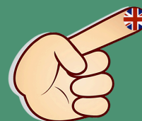
RULE OF LAW

We discuss the need for rules and laws to keep us all safe and happy. We teach children to distinguish right from wrong and the consequences of actions. We help children to understand that rules must be administered fairly and that they are there for us all to follow.